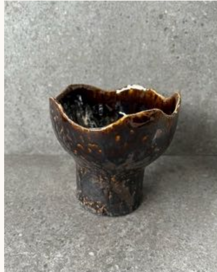
CHALICE "GLIMPSE OF GOLD" Large (17cm) $125 Small (10cm) $95