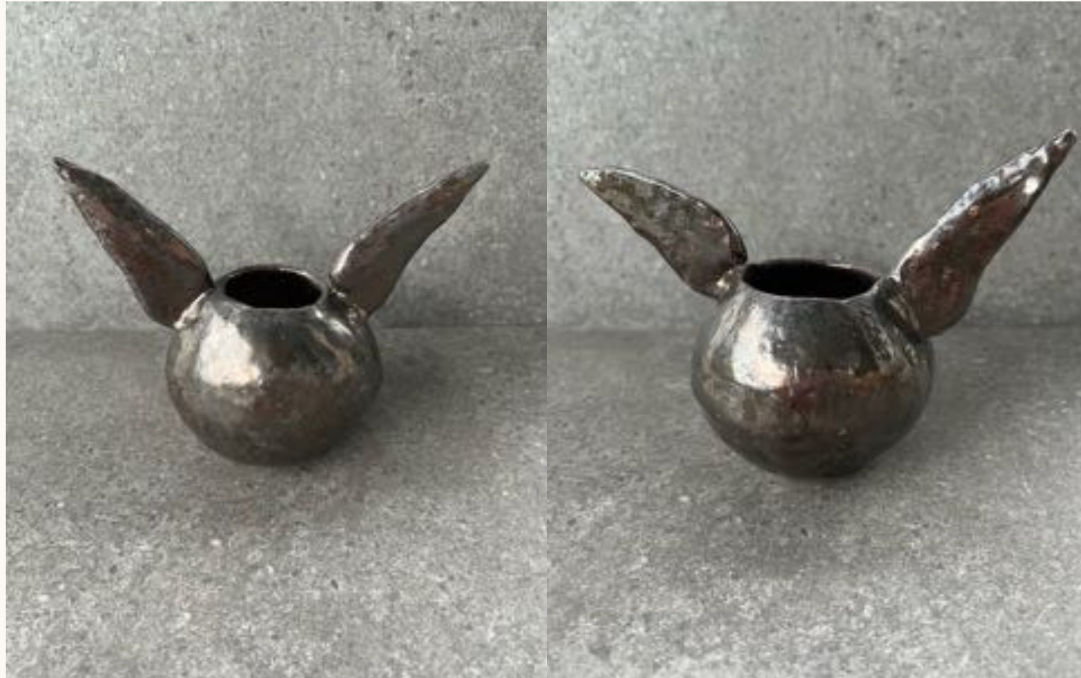
ARTEMIS 'Flight" WINGTIP 12CM H 9 CM WIDE $95