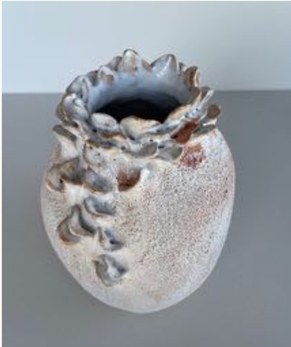
CORAL POD #1 18CM H 14CM W $360