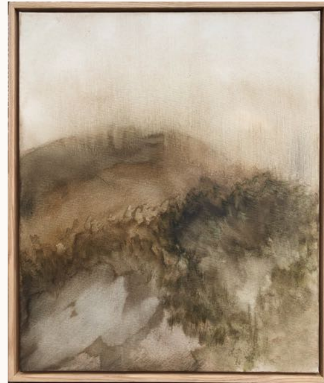
Mist on Oberon SOLD Earth pigment on canvas with Australian oak frame 50x60m $780