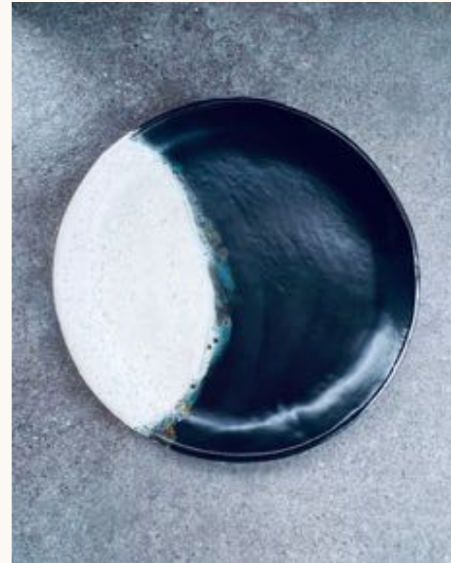
ARTEMIS MOON PLATTER #1 33CM DIAM 3CM HIGH $165