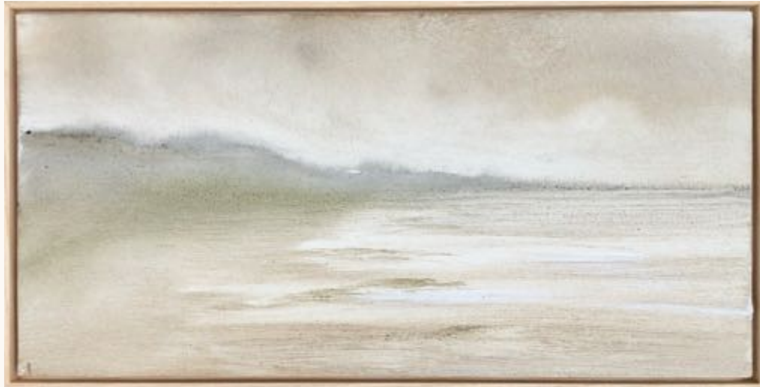
Kennett River SOLD Earth pigment on canvas with Australian oak frame 25x50m $500