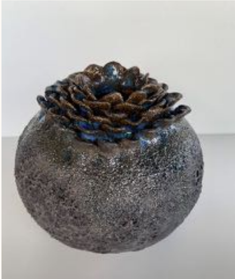
BLACK CORAL #3 14CM H 18CM W $360