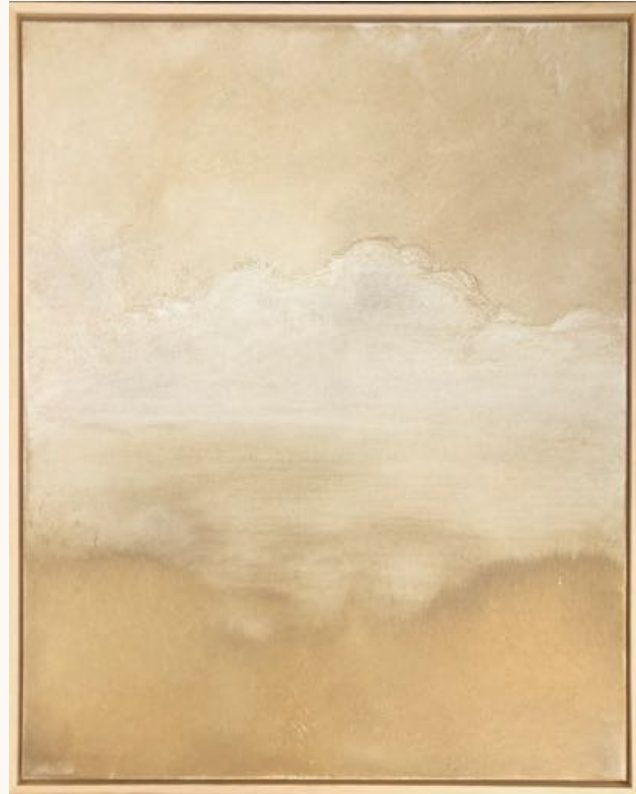
Honey clouds SOLD Earth pigment on canvas with pine frame 40x50cm $550