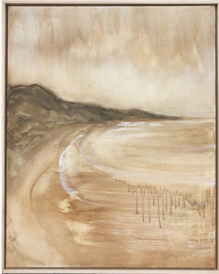
The long wave Earth pigment on canvas with Australian oak frame 60x76cm $900