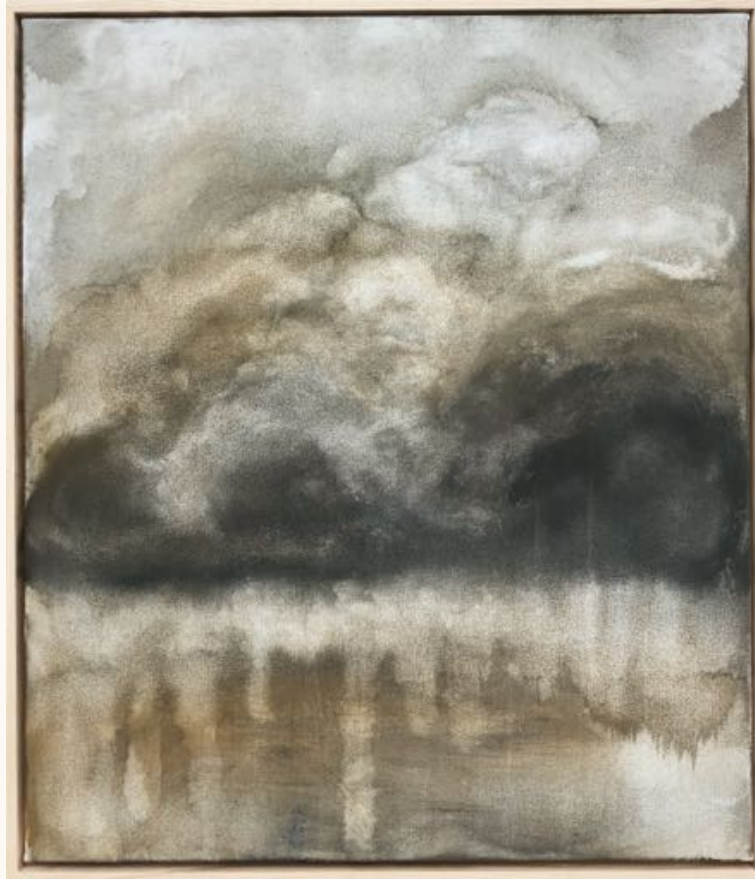
Inclement Earth pigment on cotton with Australian oak frame 60x70cm $900