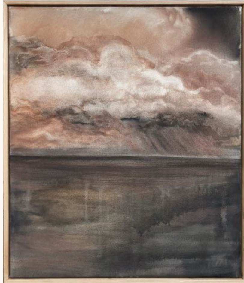
Offshore Earth pigment on cotton with Australian oak frame 60x70cm $900