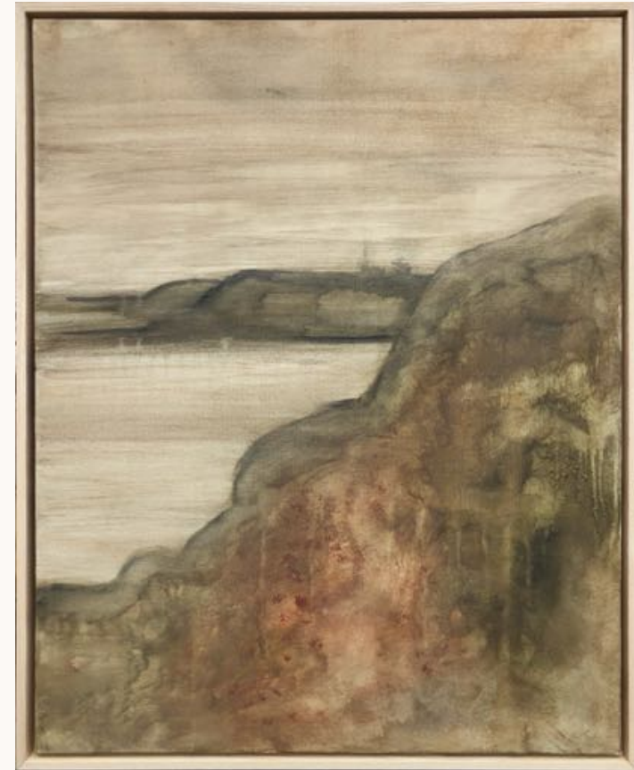
Pigface at Fishies Earth pigment on canvas with Australian oak frame 60x76cm $900