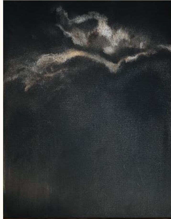
Moonlight SOLD Earth pigment on cotton with Australian oak frame 35x40cm $550