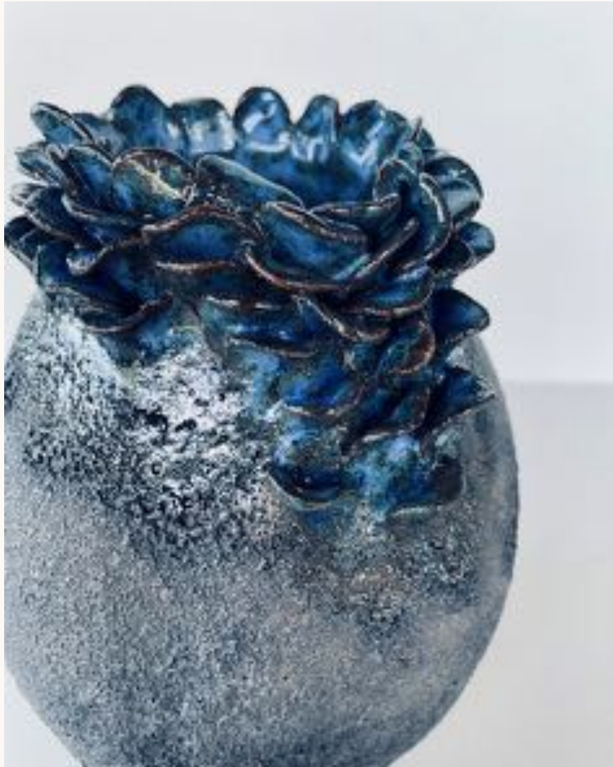
BLACK CORAL #1 18CM H 14CM W $360