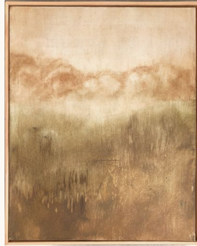
Melon clouds Earth pigment on canvas with pine frame 40x50cm $550