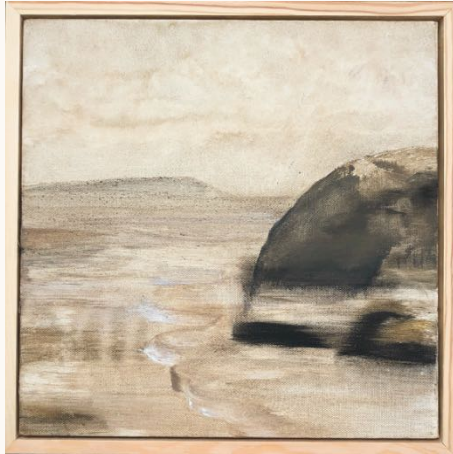
Tide's out, Squeaky beach SOLD Earth pigment on canvas with pine frame 30x30cm $450