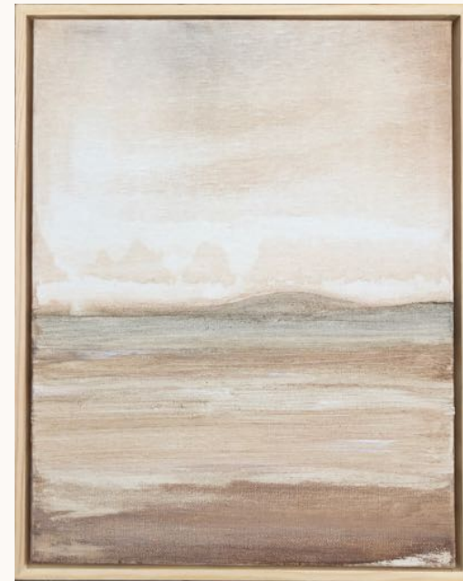
Arthurs seat from Rosebud SOLD Earth pigment on canvas with pine frame 30x35cm $380