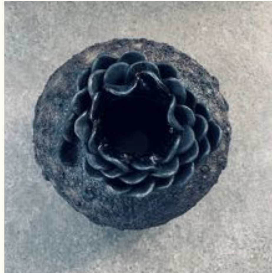
BABY CORAL 10CM H 8CM W $125