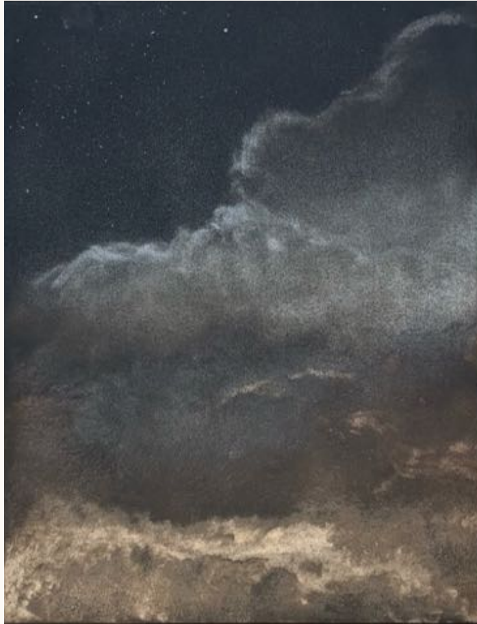
Stargazing SOLD Earth pigment on cotton with Australian oak frame 35x40cm $550