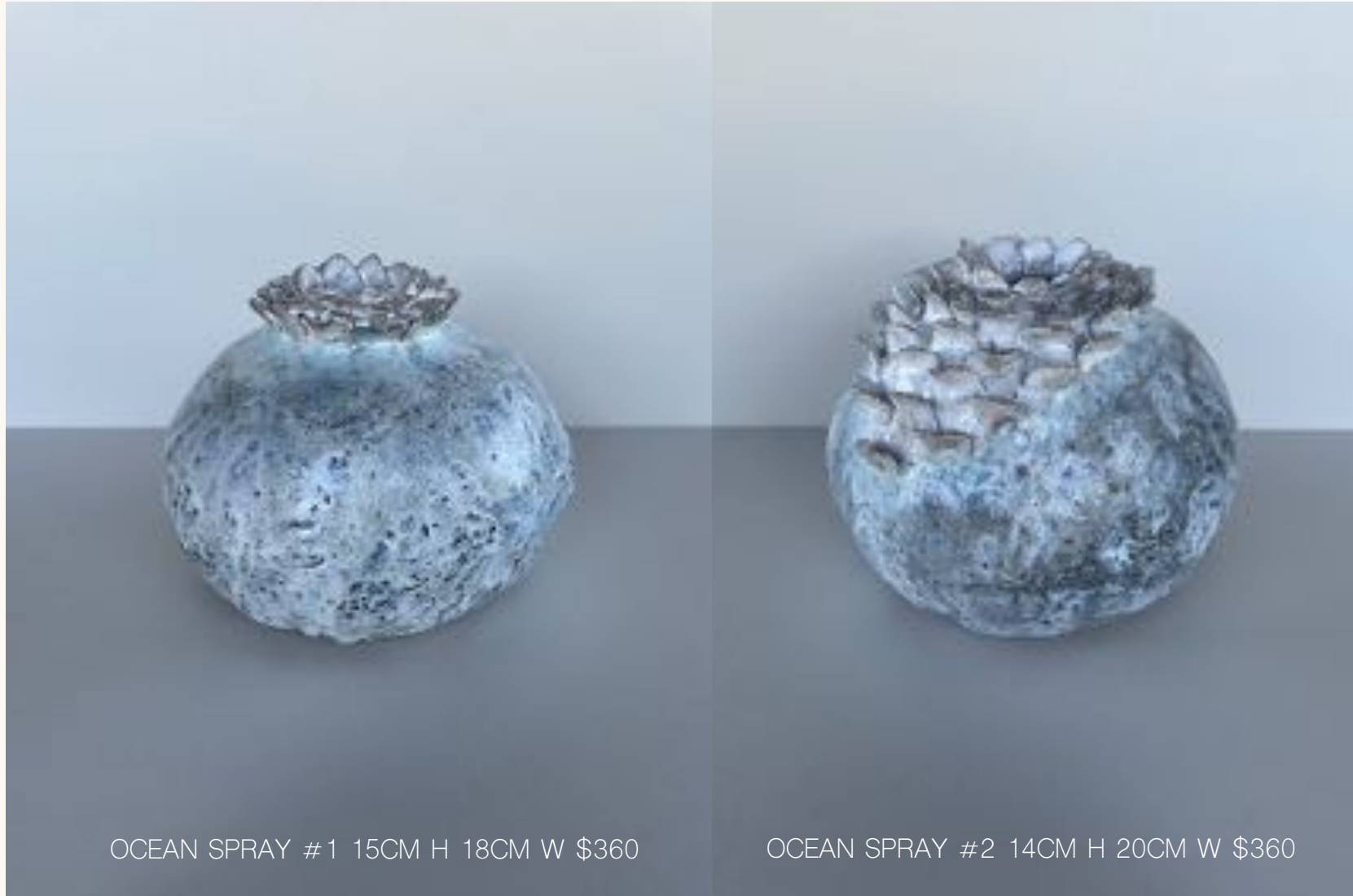
OCEAN SPRAY #1 15CM H 18CM W $360