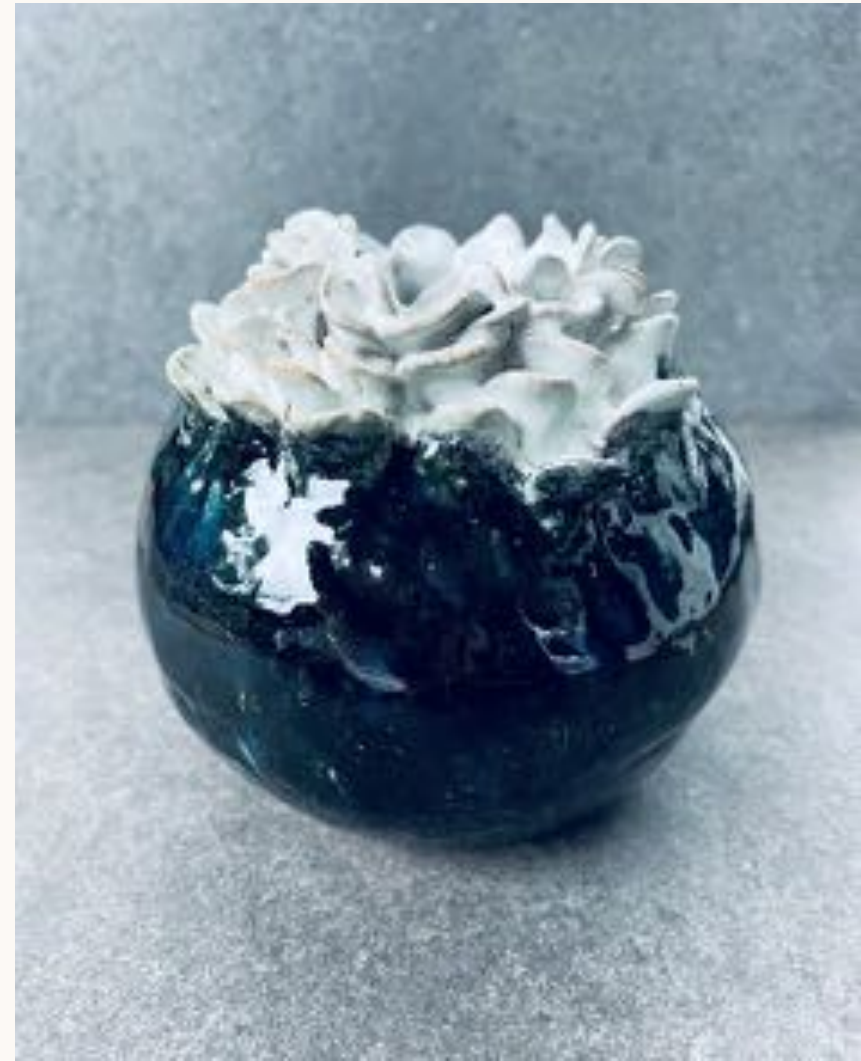
OCEAN AT NIGHT 14CM H 18CM W $360