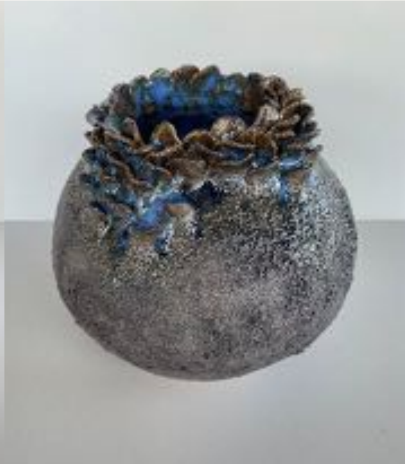
BLACK CORAL #2 14CM H 18CM W $360