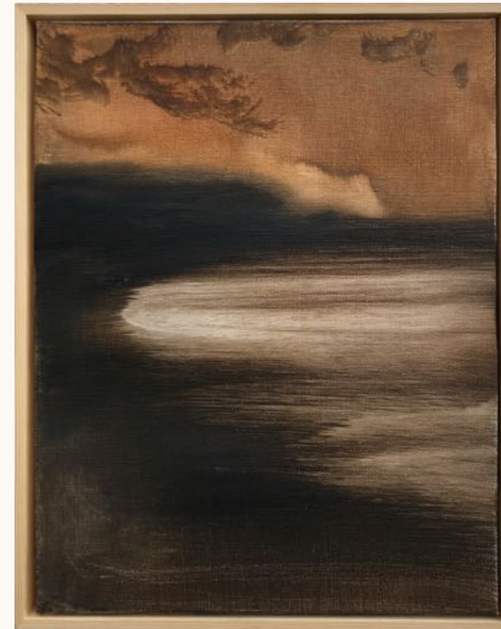
Night swim, South Beach SOLD Earth pigment on canvas with pine frame 30x35cm $380