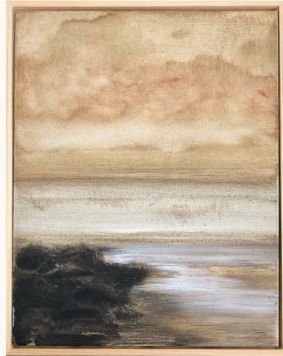
A walk after dinner SOLD Earth pigment on canvas with pine frame 30x35cm $380